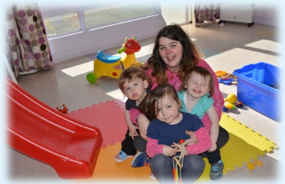
Mums and Tots