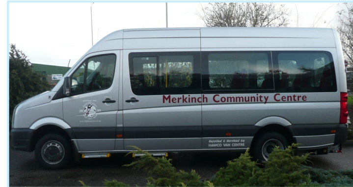
Merkinch Community Centre Mini Bus which is used by 40 community groups in Inverness and is out on the road most days or the week throughout the year. YOU CAN HIRE IT !!