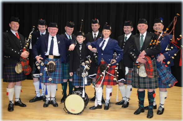
Merkinch Community Centre Pipe Band