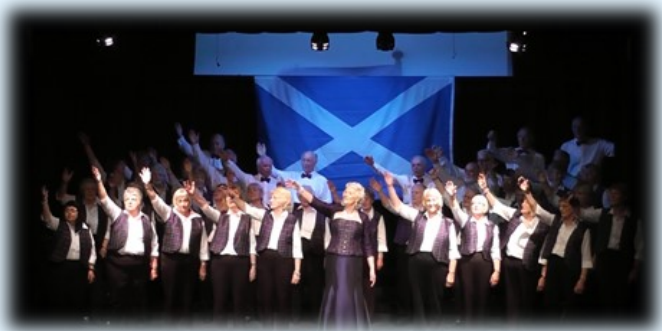
Our Scottish Variety Show