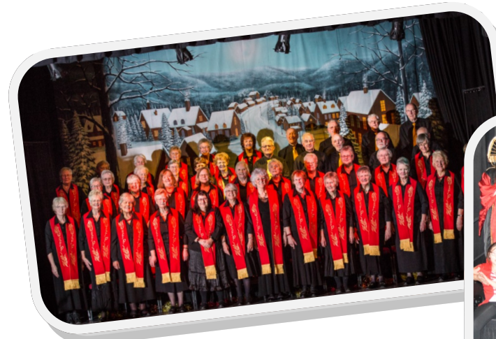
SFP wearing their new choir stoles

Golden Drama Group and Highland Youth Theatre cast for Dick Whittington