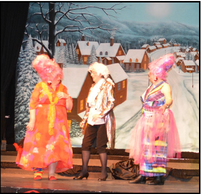
This me on the left playing the part of an 'ugly sister' in the Christmas Panto, it was great fun!!

Merkinch Community Centre is the friendliest place in town and it keeps me happy!