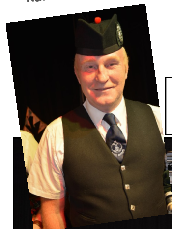
Our Pipe Band proudly wear their new ties