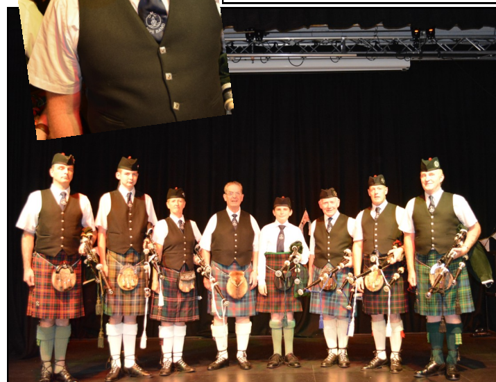
Our Merkinch Community Centre Pipe Band recently had ties specially made with the MCC logo embroidered on them.

They were proudly worn at our 'June Jamboree' where the pipe band opened the concert with a set of rousing tunes. The band also closed the concert with 'Scotland the Brave' and everyone enjoyed a great celebration.