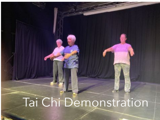
Tai Chi Demonstration