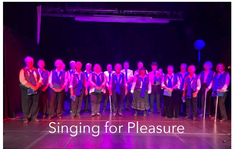
Singing for Pleasure