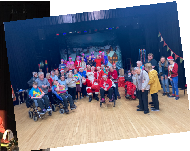
Rainbow Singers Party